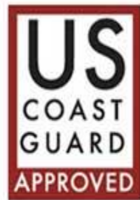
United States Coast Guard Approved (CGA) flotation device.